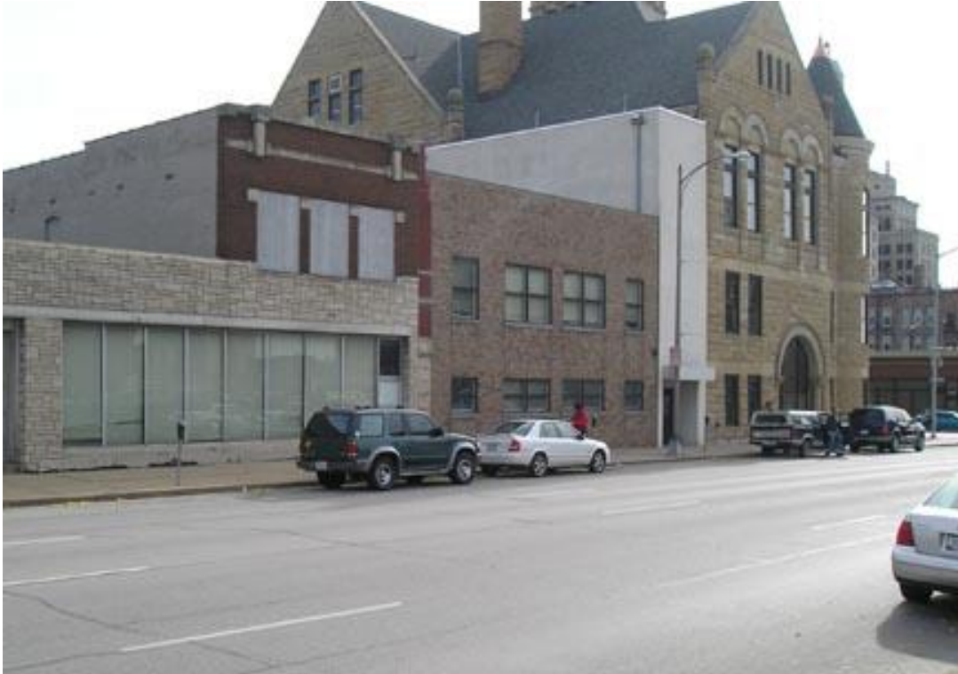
View of west elevation and Harrison streetscape. Note the addition to the north elevation (white columnar entrance.)

Address _____ 226 W. 4 th Street _____ City _____ Davenport _____