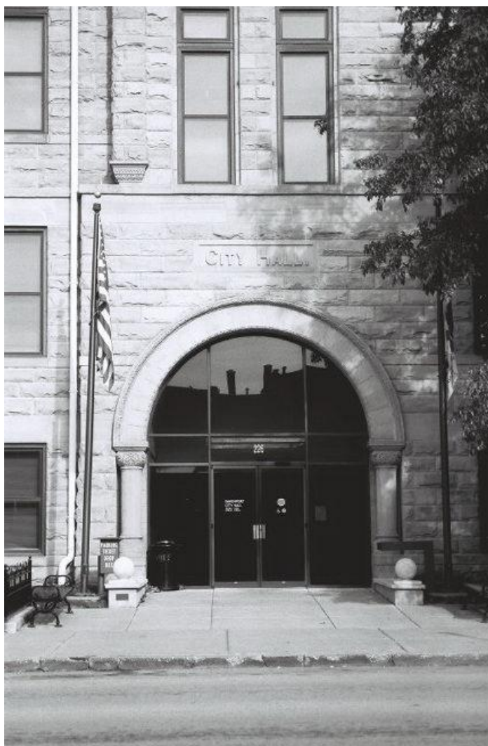
View of the primary (4 th Street) entrance, which features a prominent Roman arch supported by short columns with ornately carved capitals.

Address _____ 226 W. 4 th Street _____ City _____ Davenport _____