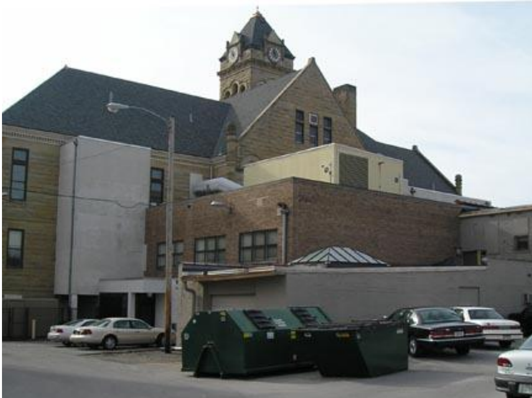
View of north elevation, looking southwest. From this vantage point the piling up of additions and mechanical systems is apparent.

Address _____ 226 W. 4 th Street _____ City _____ Davenport _____