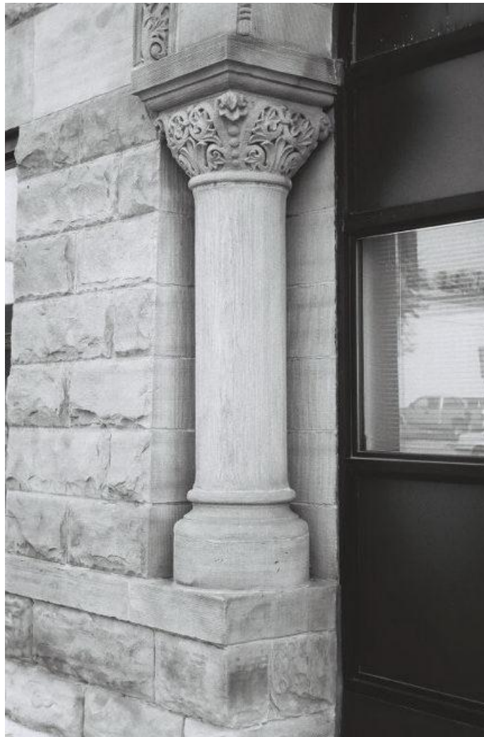
Detail view of a column that flanks the building's entrances. This column is located on the building's west elevation.

Address _____ 226 W. 4 th Street _____ City _____ Davenport _____