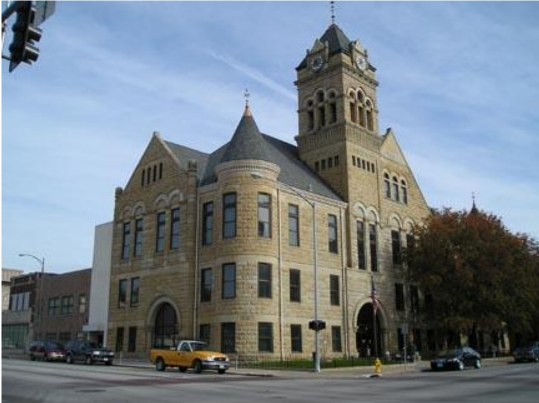
View of the Davenport City Hall, looking northeast from West Fourth Street.

Address _____ 226 W. 4 th Street _____ City _____ Davenport _____