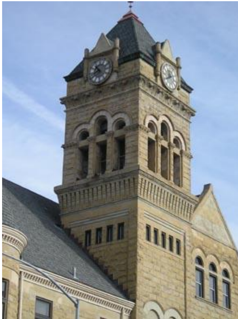
Detail view of the building's clock tower. The massive strength of the Richardsonian Romanesque is clearly and beautifully expressed in the tower.

Address _____ 226 W. 4 th Street _____ City _____ Davenport _____