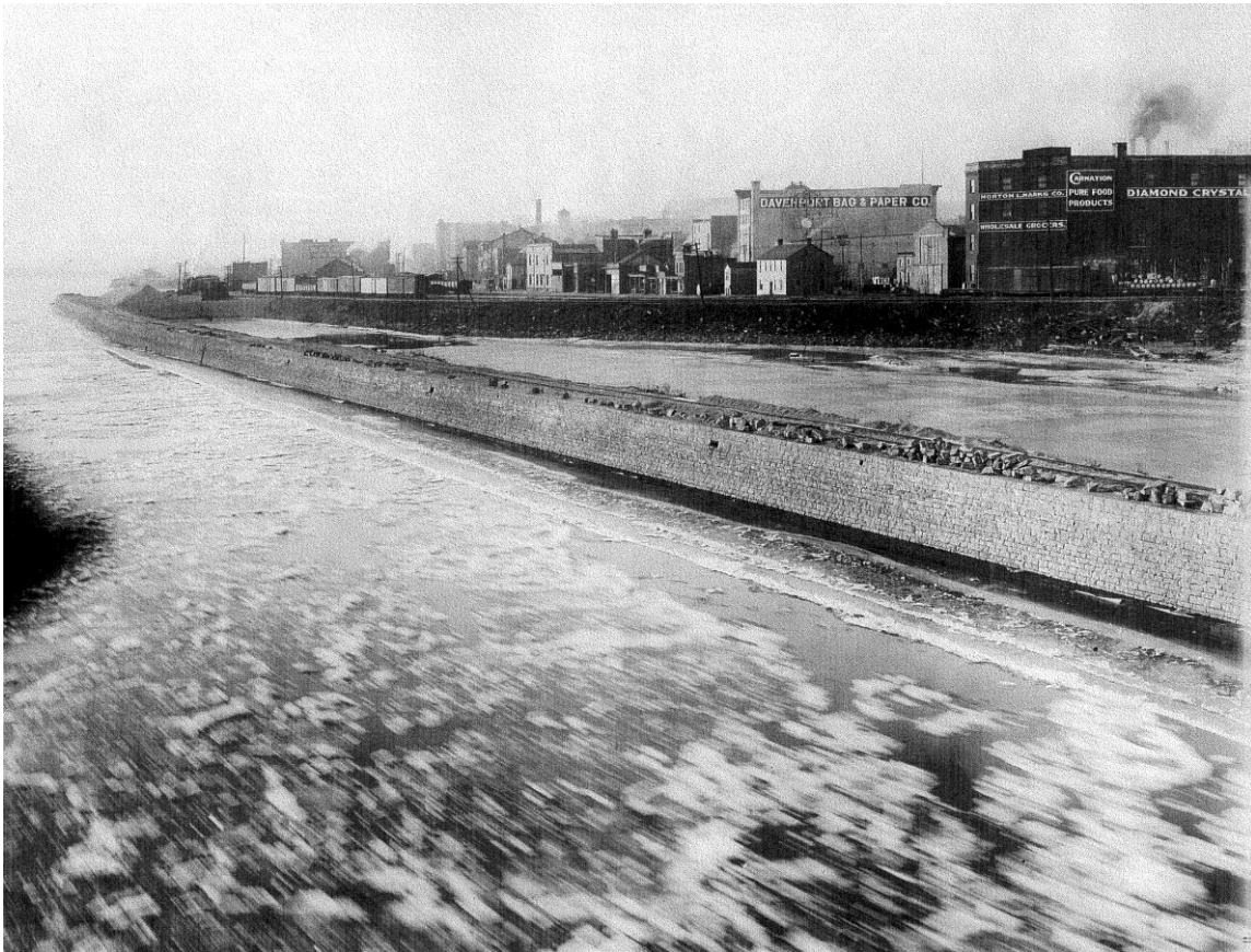
This undated historic image documents the impact of the Davenport Bag & Paper Co. building on the city skyline.

Address _____ 301 E. 2nd Street _____ City _____ Davenport _____