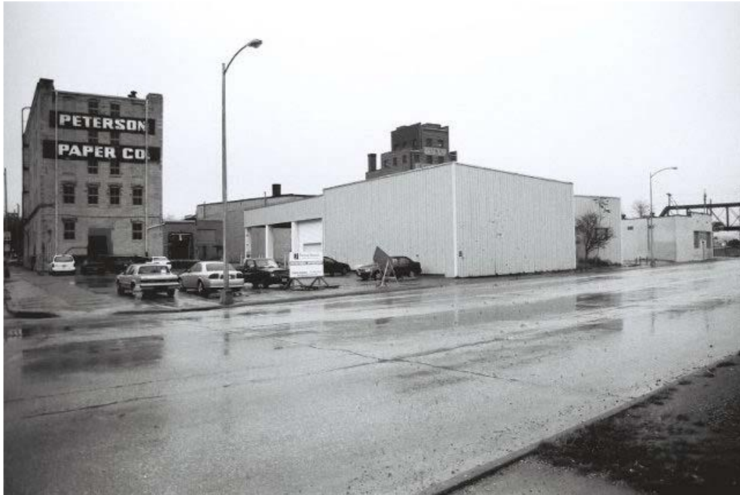
View of the Davenport Bag and Paper Co. building within the context of its streetscape (looking northeast across East River Drive.)

Address _____ 301 E. 2nd Street _____ City _____ Davenport _____