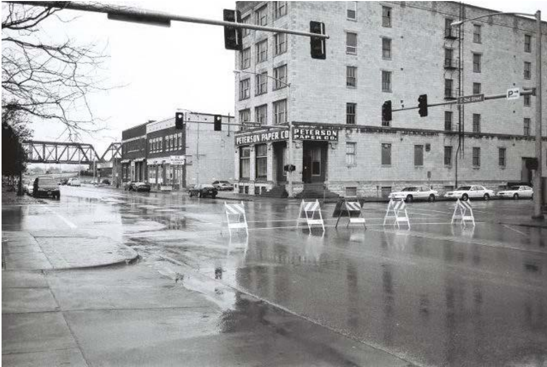
View of the Davenport Bag and Paper Co. building within the context of its streetscape (looking east on E. 2nd Street from Pershing.)

Address _____ 301 E. 2nd Street _____ City _____ Davenport _____