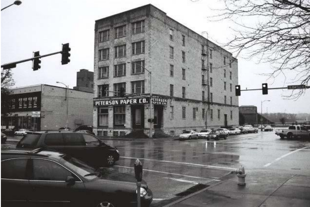
View of the Davenport Bag and Paper Co. building (aka Peterson Paper Co.), looking southeast across the intersection of Pershing and E. 2nd Streets.

Address _____ 301 E. 2nd Street _____ City _____ Davenport _____