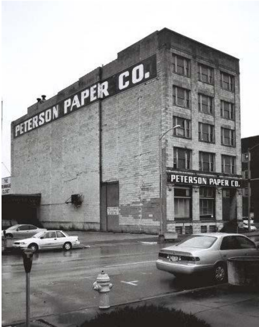
View of the primary (north) and east elevations, looking southwest across E. 2nd Street.

Address _____ 301 E. 2nd Street _____ City _____ Davenport _____