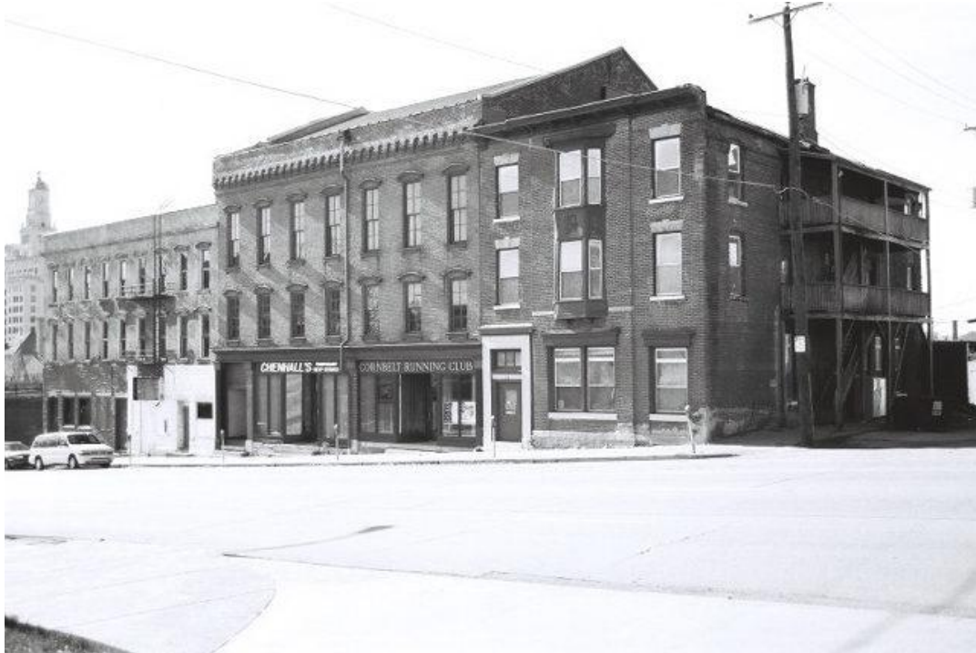
View of the Old City Hall in the context of its streetscape (looking southwest across Brady Street.)

Address _____ 514 Brady Street _____ City _____ Davenport _____