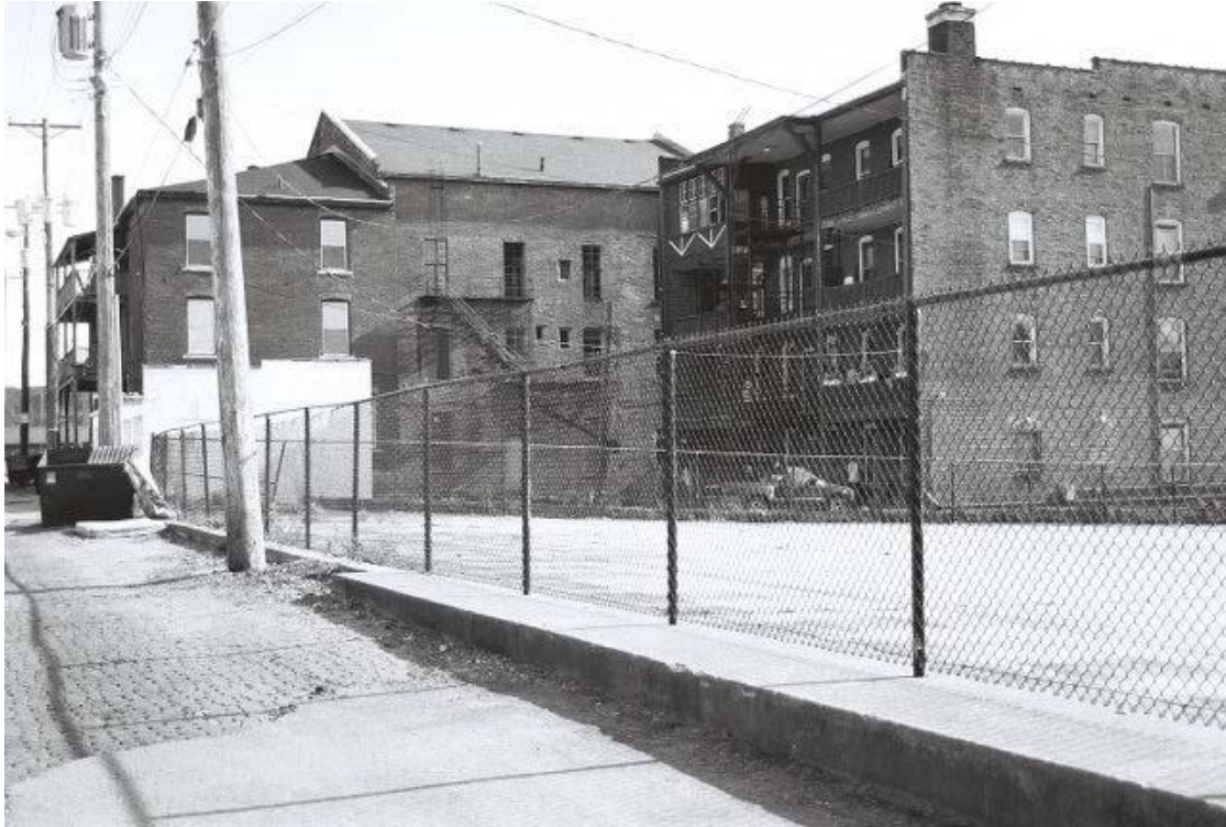
View of the rear (west) elevation, looking east from the alley.

Address _____ 514 Brady Street _____ City _____ Davenport _____