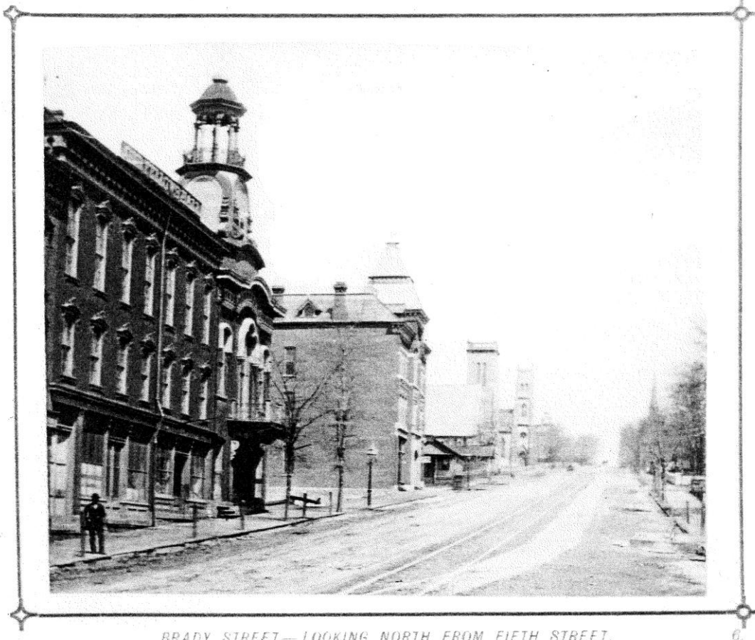
BRADY STREET—LOOKING NORTH FROM FIFTH STREET.

Address _____ 514 Brady Street _____ City _____ Davenport _____