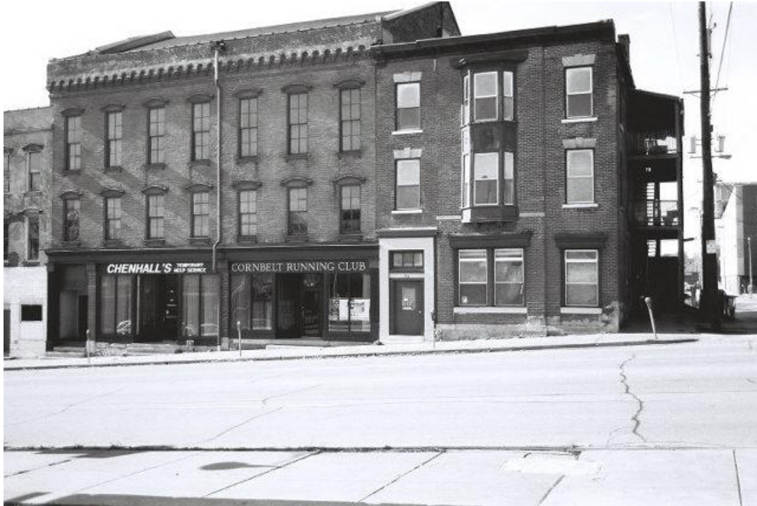
View of primary (east) elevations, looking west across Brady Street. The Old City Hall is indicated with an arrowhead.

Address _____ 514 Brady Street _____ City _____ Davenport _____