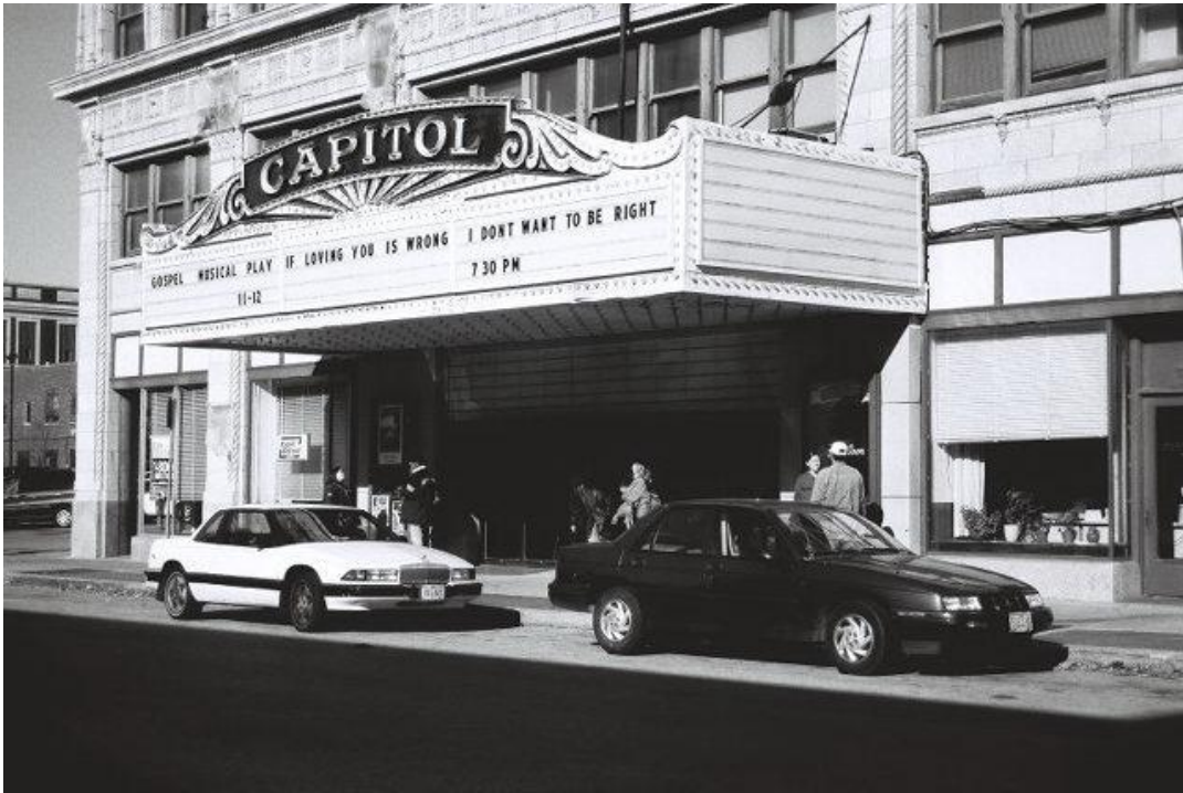
Detail view of the Capitol Theatre marquee located on the building's south elevation. An image of the historic canopy can be found in the Richardson-Sloane Special Collections of the Davenport Public Library (Image #VM89-000195). Regretfully, it is not included here.

Address _____ 320 (320-336) W. 3rd Street _____ City _____ Davenport _____