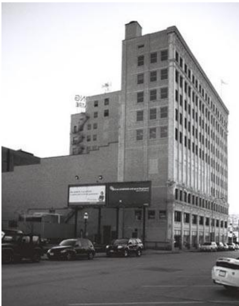
View of north and west elevations, looking south from the intersection of Ripley and West Fourth Streets.

Address _____ 320 (320-336) W. 3rd Street _____ City _____ Davenport _____