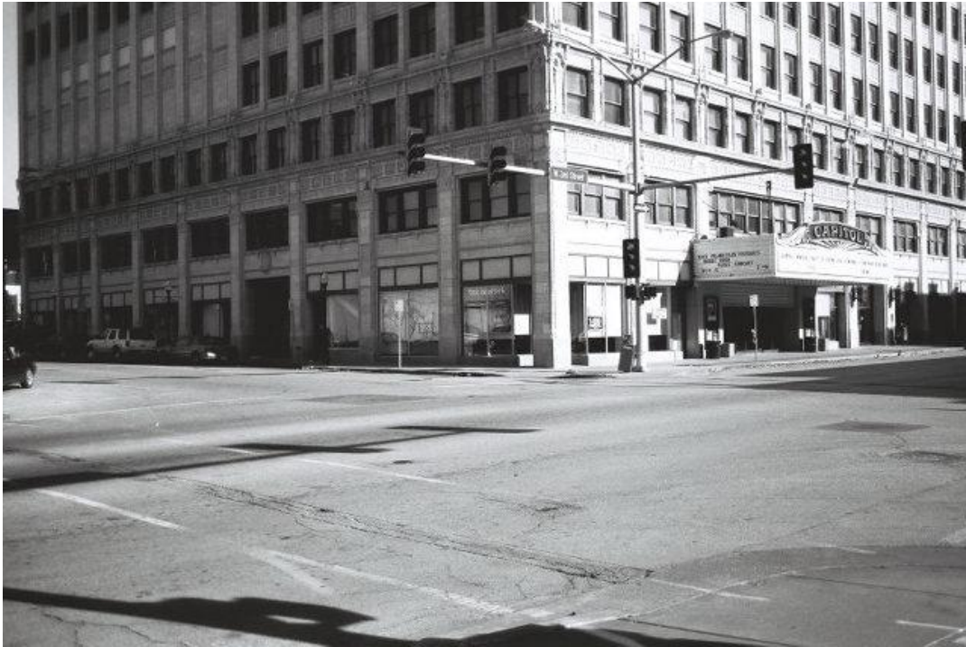
Detail view of street level, west and south elevations, looking northeast from the intersection of Ripley and West Third Streets.

Address _____ 320 (320-336) W. 3rd Street _____ City _____ Davenport _____