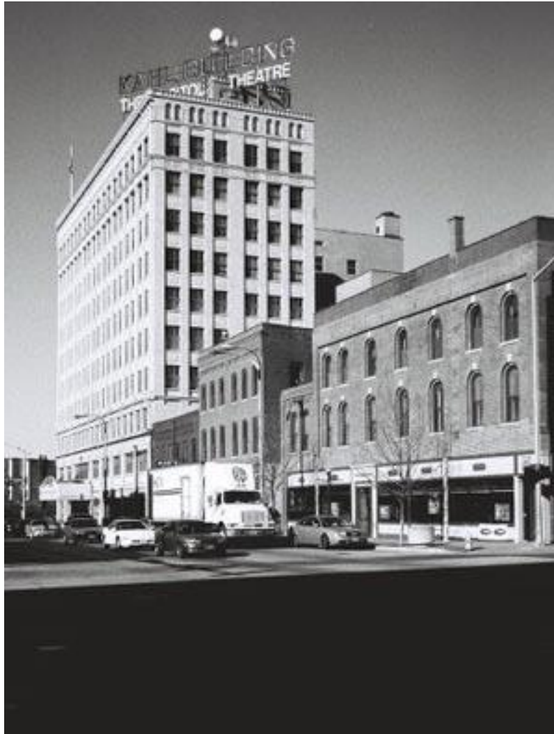
View of the Kahl Building/Capitol Theater, looking west along West Third Street.

Address _____ 320 (320-336) W. 3rd Street _____ City _____ Davenport _____