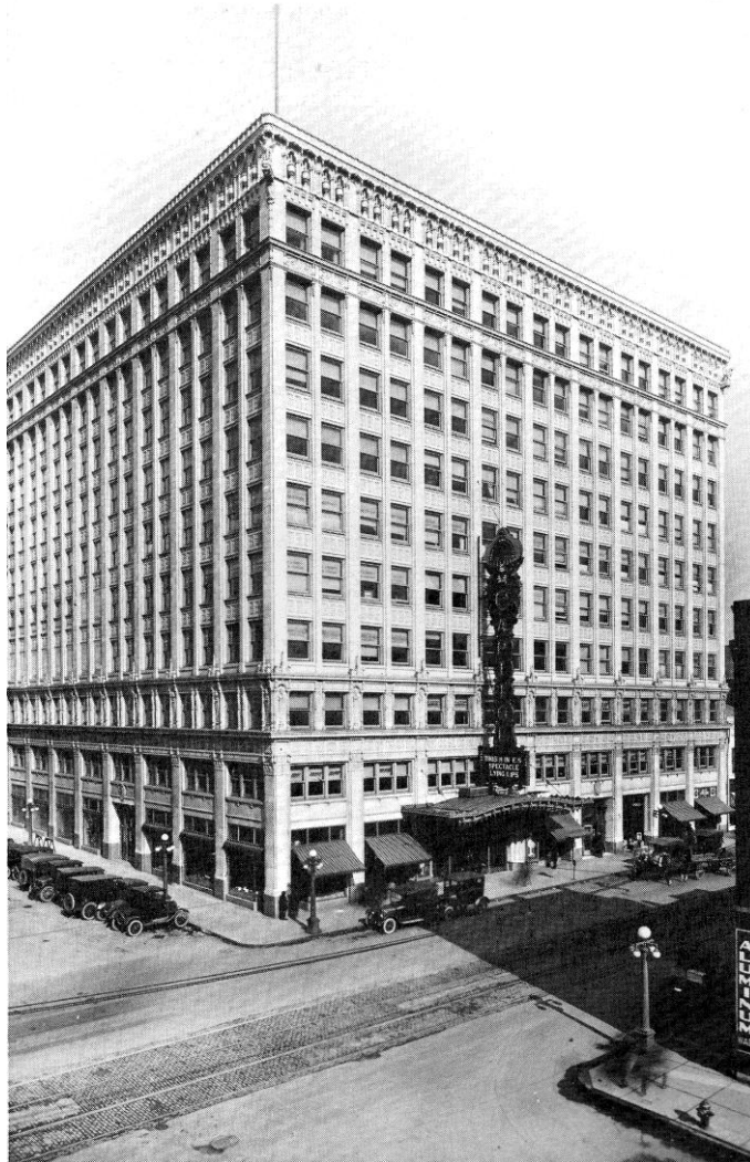
Judging from the automobiles parked on the street, this undated historic image documents the Kahl Building within a few short years after its construction in 1920.

Address _____ 320 (320-336) W. 3rd Street _____ City _____ Davenport _____