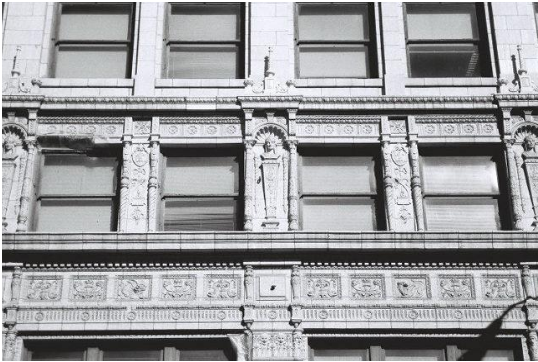
Detail view of the upper story fenestration and terra cotta details (south elevation.)

Address _____ 320 (320-336) W. 3rd Street _____ City _____ Davenport _____