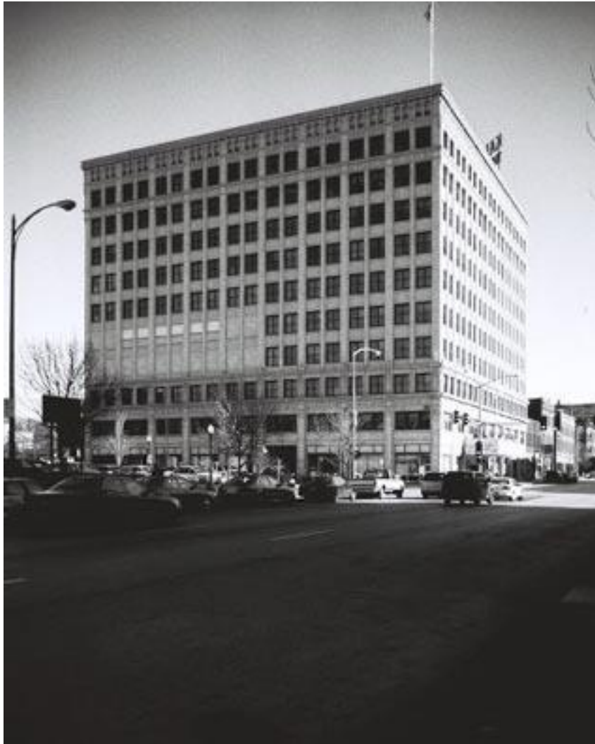
View of west and south elevations, looking northeast from the 400 block of West Third Street.

Address _____ 320 (320-336) W. 3rd Street _____ City _____ Davenport _____