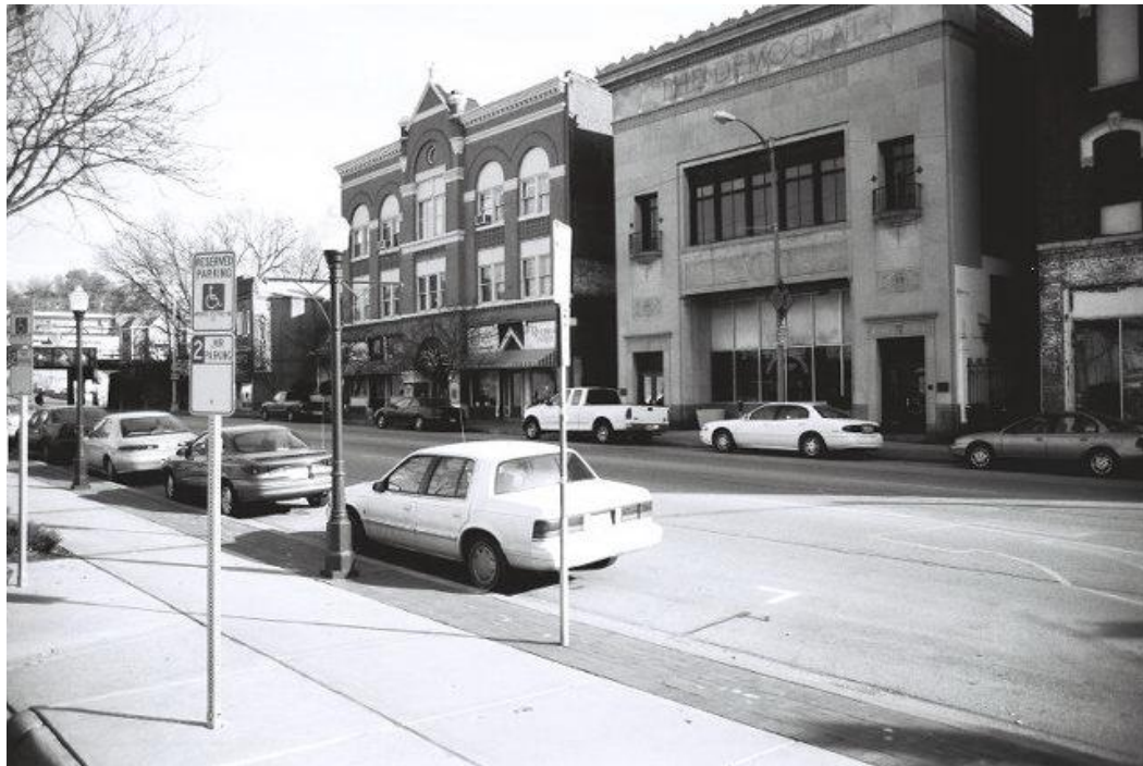
View of the streetscape that includes the Worley House, not visible from this angle because of its deep setback from the street.

Address _____ 425 Brady Street _____ City _____ Davenport _____