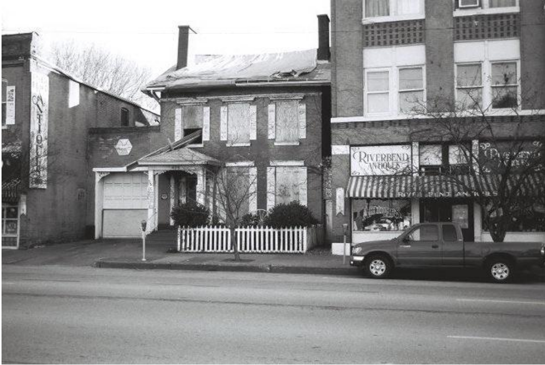
View of the primary (west) elevation, looking east across Brady Street. At the time of this photograph, the building's roof and windows were soon to be replaced.

Address _____ 425 Brady Street _____ City _____ Davenport _____