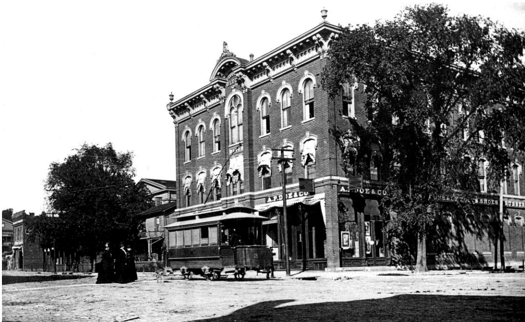
This c.1890 image documents the streetscape of which the Worley House (1860) was a part. From this angle, the tree obscures a view of the residence.

Address _____ 425 Brady Street _____ City _____ Davenport _____