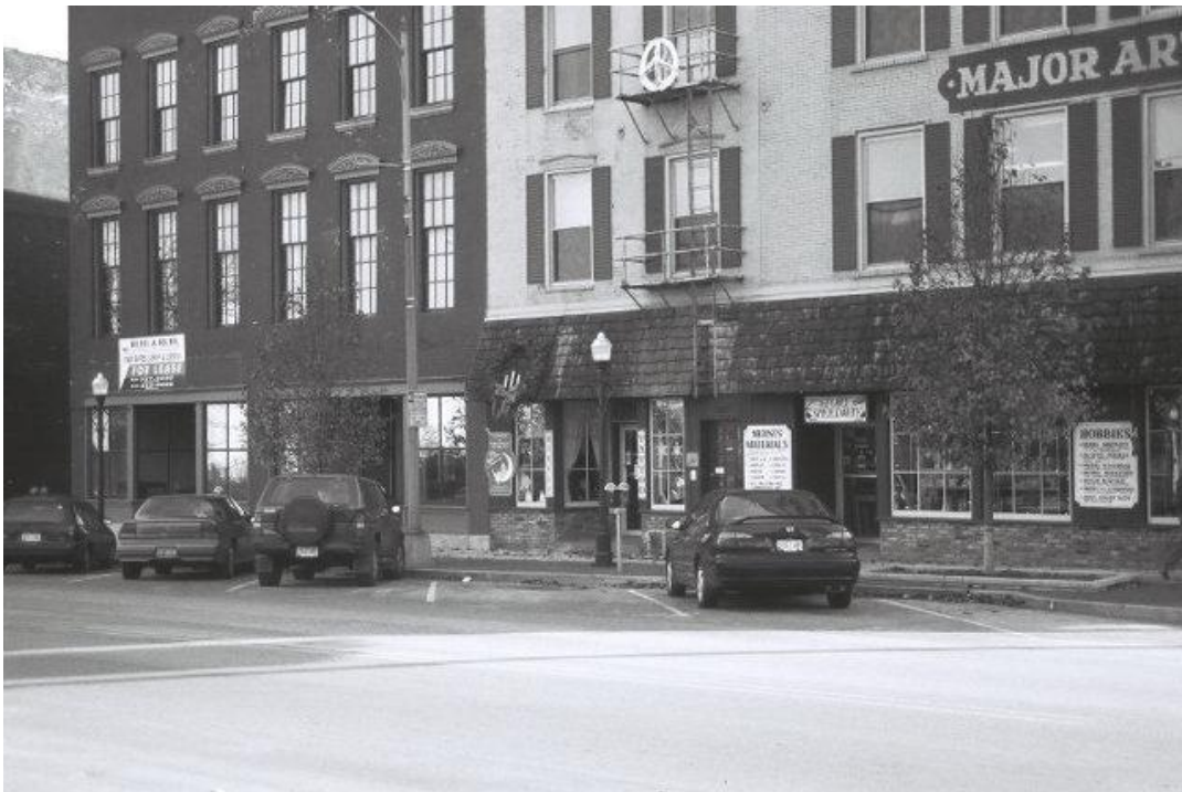
View of the Knostman building, looking southeast across E. 2 nd Street.

Address _____ 207 (207-209) E. 2 nd Street _____ City _____ Davenport _____