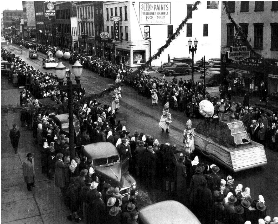
This 1940s view of East Second Street, looking southeast from between Brady and Perry Streets, documents the Knostman building within the context of its mid-century streetscape.

Address _____ 207 (207-209) E. 2 nd Street _____ City _____ Davenport _____