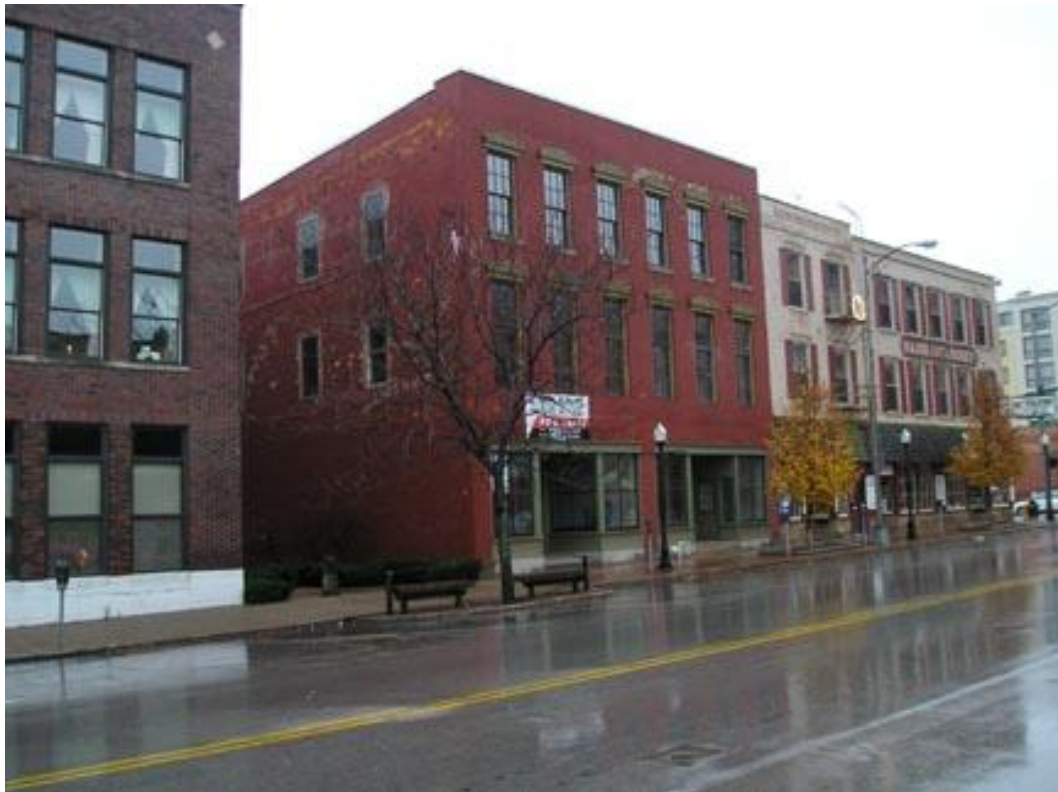
View of the primary (north) elevation, looking southwest across E. 2 nd Street.

Address _____ 207 (207-209) E. 2 nd Street _____ City _____ Davenport _____