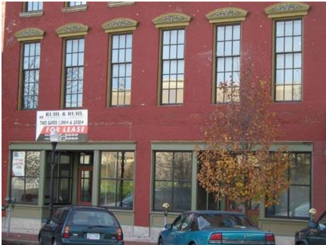
Detail view of the storefronts and first story fenestration. Note that the window configuration remains intact, as do the ornate window hoods.

Address _____ 207 (207-209) E. 2 nd Street _____ City _____ Davenport _____