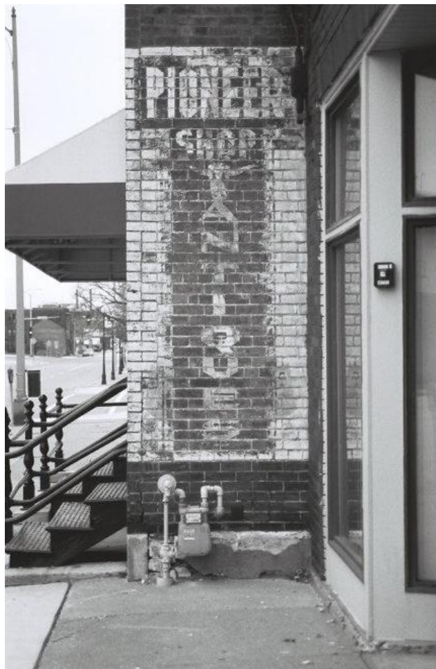
This signage remnant is located on the east wall of the building. It reads “Pioneer Shop Antiques”.

Address _____ 526 W. 2 nd Street _____ City _____ Davenport _____