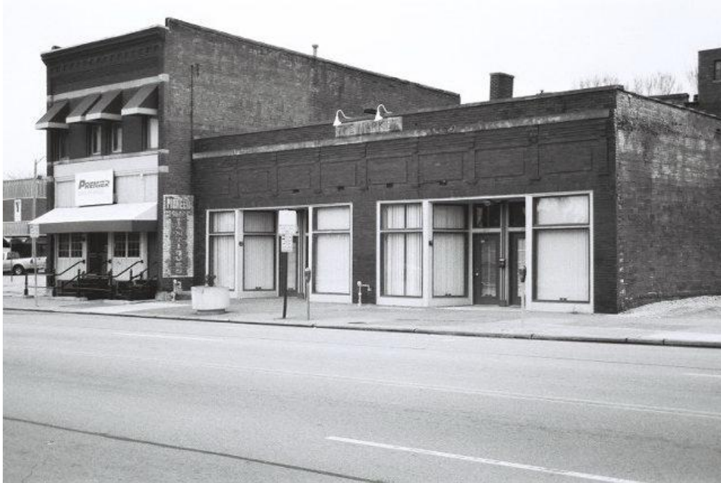
View of the Iowa Reform building (at left); south elevation, looking northwest across West Second Street.

Address _____ 526 W. 2 nd Street _____ City _____ Davenport _____