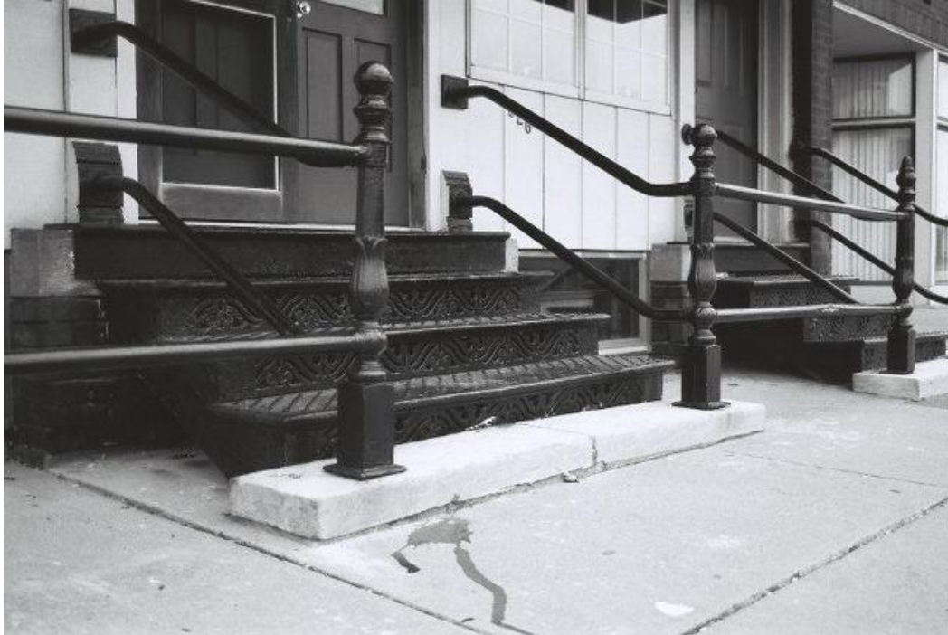
Detail view of the cast iron steps and railings.

Address _____ 526 W. 2 nd Street _____ City _____ Davenport _____