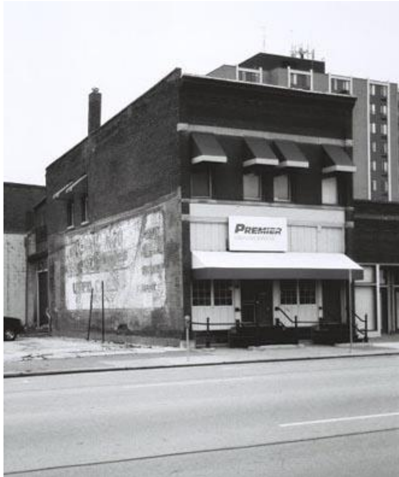
View of the primary (south) and west elevations, looking northeast across West Second Street.

Address _____ 526 W. 2 nd Street _____ City _____ Davenport _____