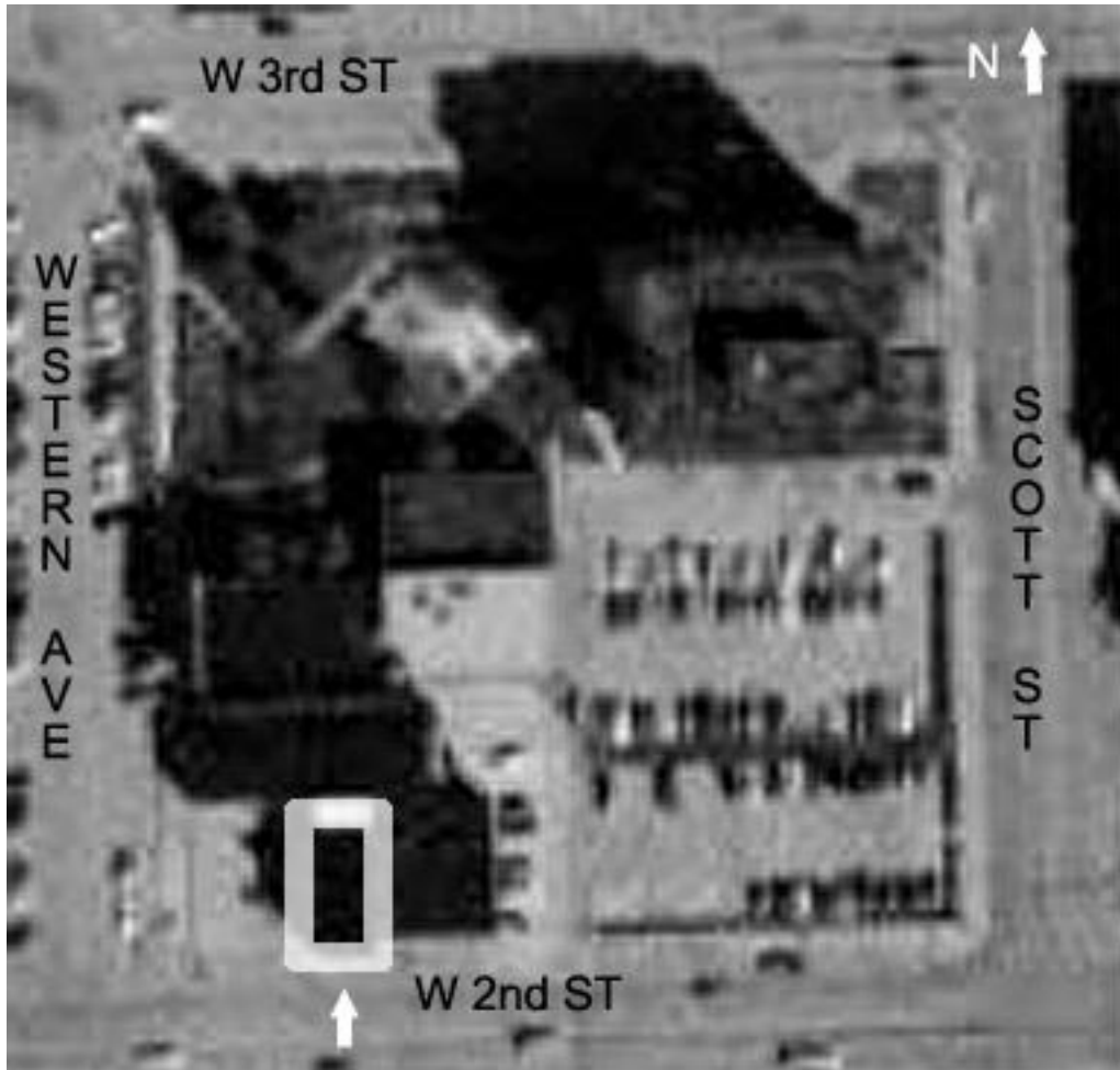
The arrow indicates the location of the Iowa Reform building.

Address _____ 526 W. 2 nd Street _____ City _____ Davenport _____