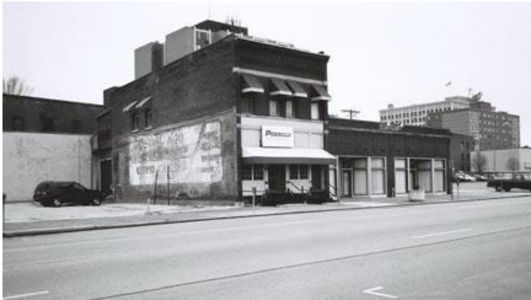
This view of West Second Street, looking northeast shows the tremendous loss of historic fabric in this block of the Davenport Downtown Commercial District.

Address _____ 526 W. 2 nd Street _____ City _____ Davenport _____