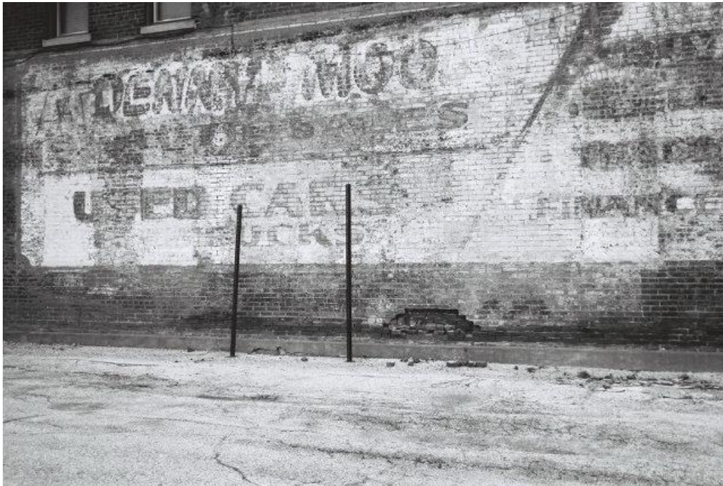
Detail view of the west elevation. The faded signage appears to read “Denny Moo Used Cars & Trucks”.

Address _____ 526 W. 2 nd Street _____ City _____ Davenport _____