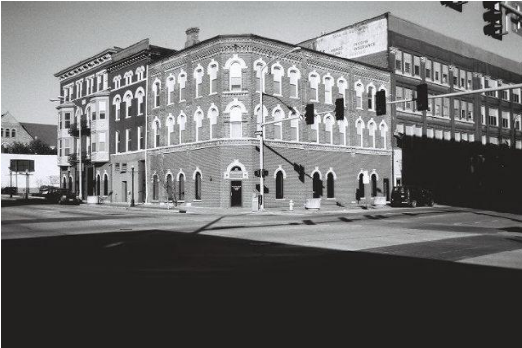
View of the Henry Berg Building (noted with an arrowhead) in the context of its streetscape.

Address _____ 246 (226-236) W. 3rd Street _____ City _____ Davenport _____