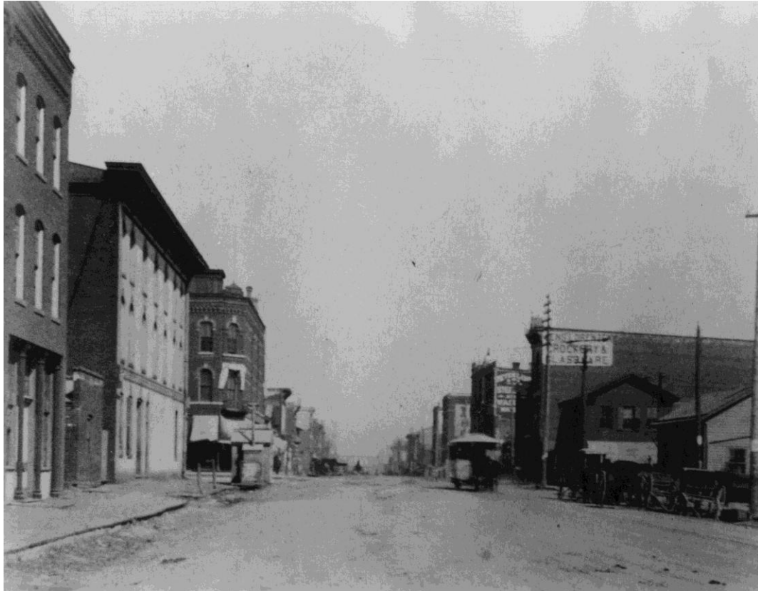
This 1880s view of West Third Street, looking east from the middle of the 300 block, documents the Berg building within the context of its original streetscape.

Address _____ 246 (226-236) W. 3rd Street _____ City _____ Davenport _____