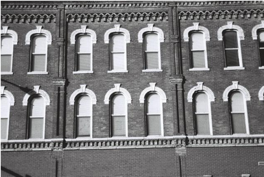
View of the Berg Building's upper story fenestration and decorative brickwork (south elevation). Both elements are critical to defining the building's architectural character. Their high level of integrity is of particular importance given the loss of the storefront level.

Address _____ 246 (226-236) W. 3rd Street _____ City _____ Davenport _____