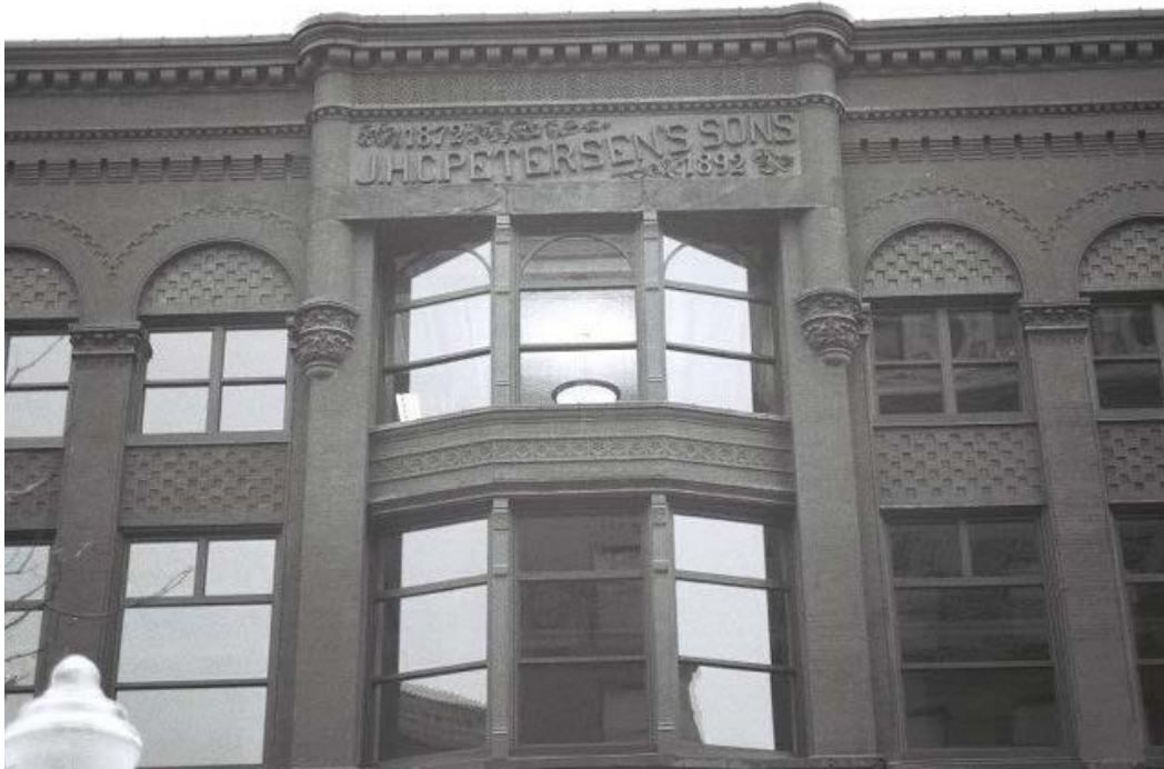
Detail view of name plaque.

Address _____ 123 (123-131) W. 2nd Street _____ City _____ Davenport _____