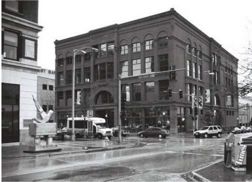
View of the primary (north) and west elevations, looking southeast across the intersection of West Second and Main Streets.

Address _____ 123 (123-131) W. 2nd Street _____ City _____ Davenport _____