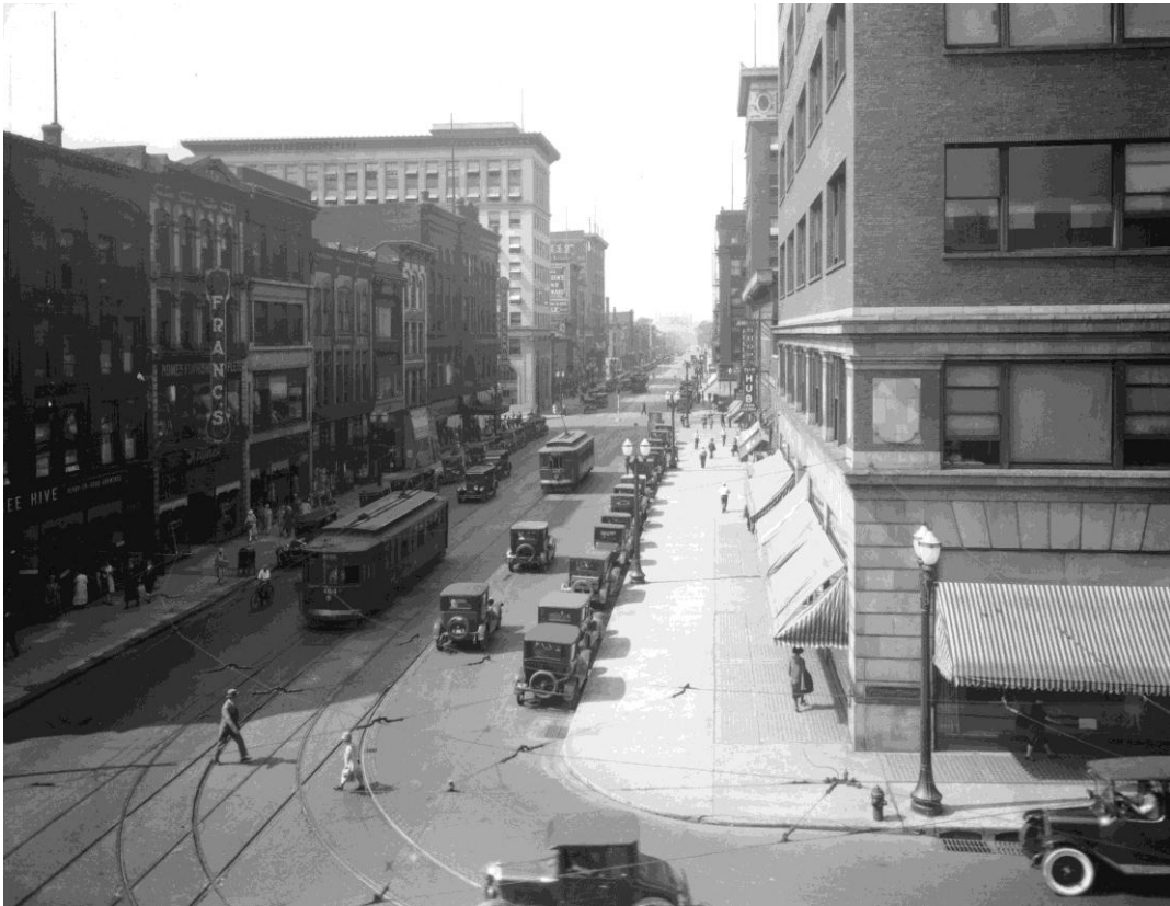
This undated (c.1925) view of West Second Street, looking west from Brady Street, documents the Petersen store (middle left) within the context of its historic streetscape.

Address _____ 123 (123-131) W. 2nd Street _____ City _____ Davenport _____