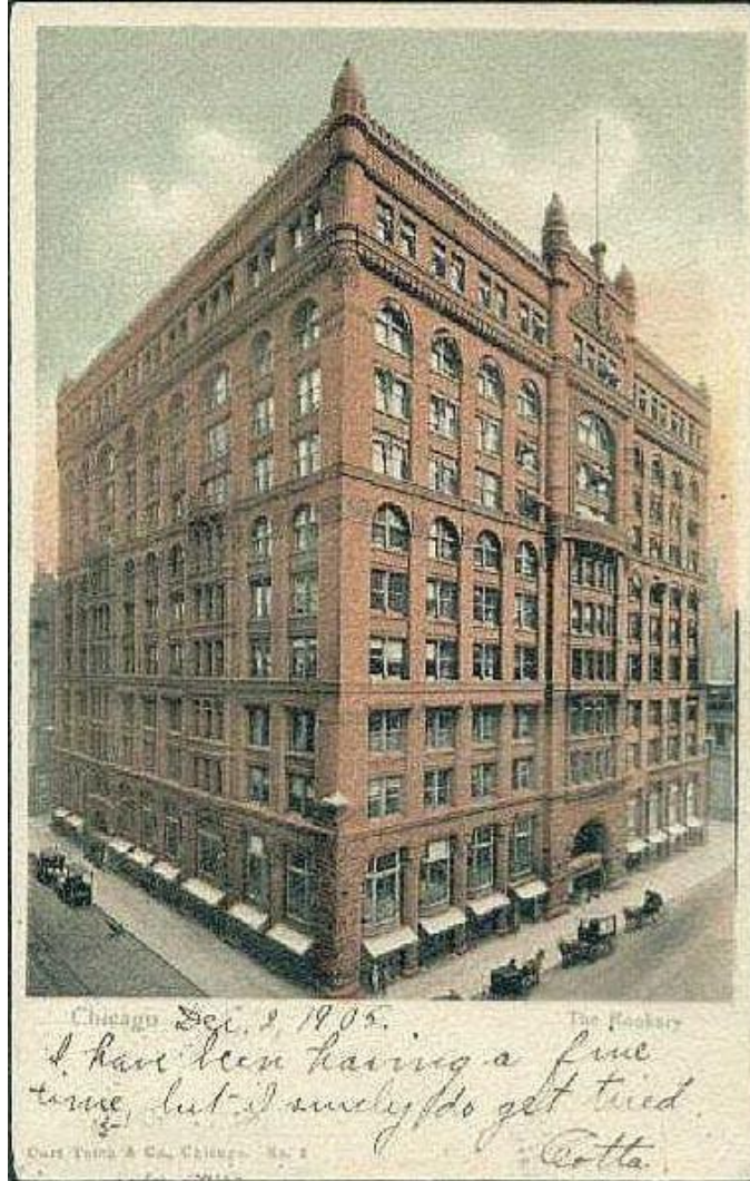
The 1885-1895 Rookery Building by the Chicago firm of Burnham & Root inspired many similar constructions throughout the country, including the J.H.C. Petersen's Sons' Store.

Address 123 (123-131) W. 2nd Street City Davenport