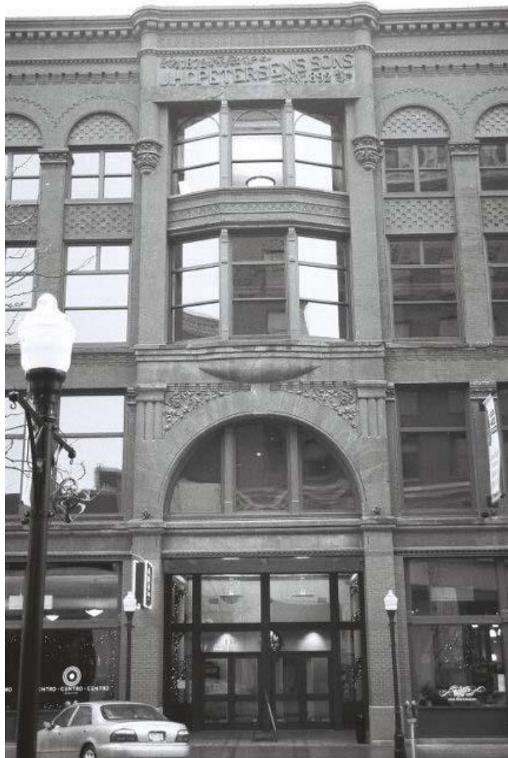
Detail view of the projecting pavilion that marks the primary entrance on the north. Notice the terra cotta detailing around the arch of the entrance and in the building's name plaque.

Address _____ 123 (123-131) W. 2nd Street _____ City _____ Davenport _____