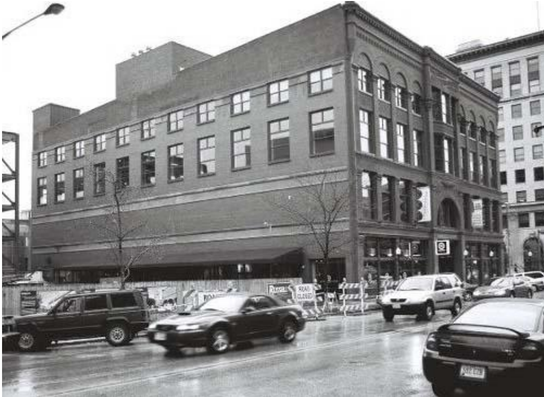
View of primary (north) and east elevations, looking southwest across West Second Street.

Address _____ 123 (123-131) W. 2nd Street _____ City _____ Davenport _____