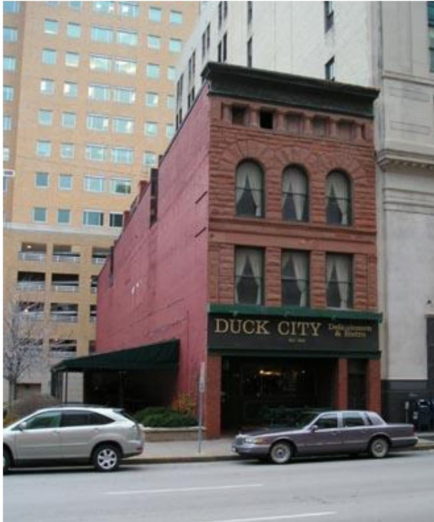
View of the primary (north) and east elevations, looking south across East Third Street.

Address _____ 115 E. 3rd Street _____ City _____ Davenport _____