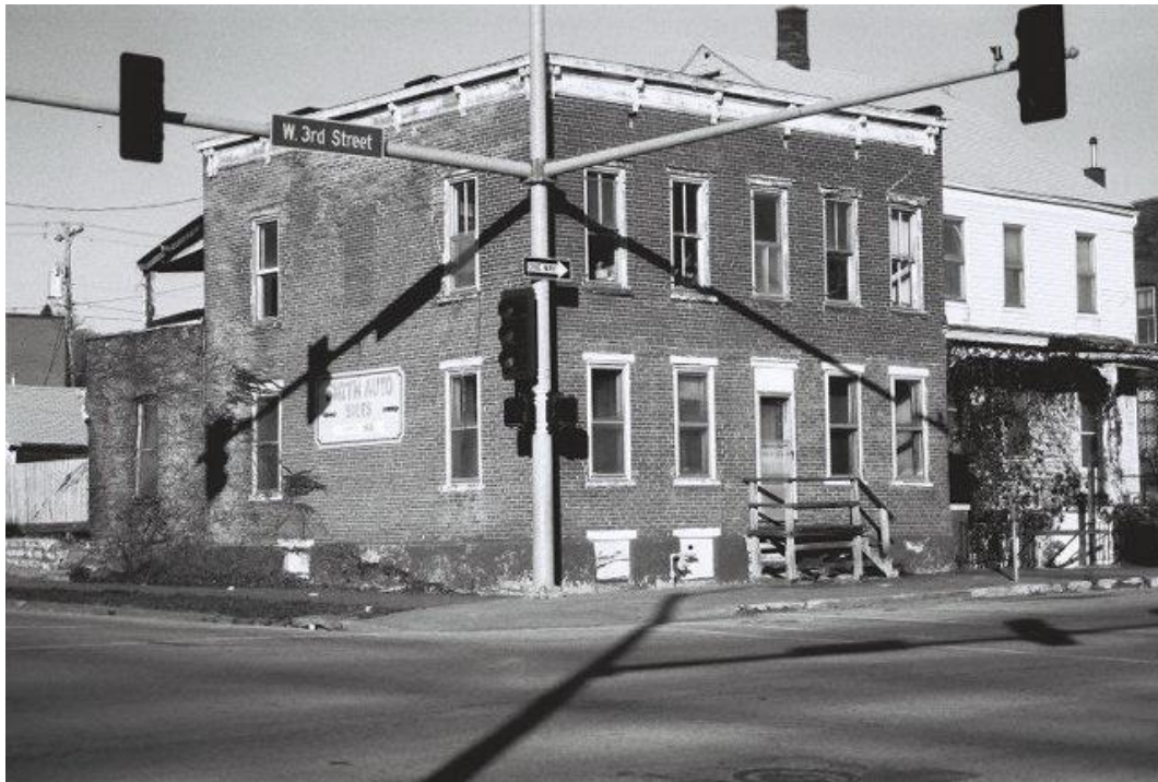
View of the primary (south) and west elevations, looking northeast across the intersection of W. 3rd and Gains Streets.

Address _____ 632 W. 3rd Street _____ City _____ Davenport _____