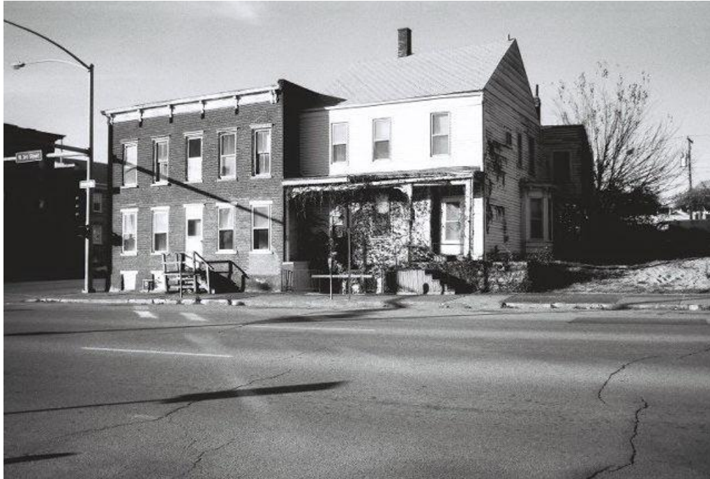
View of the Siemer House and its adjoining neighbor, the Stahmer House.

Address _____ 632 W. 3rd Street _____ City _____ Davenport _____