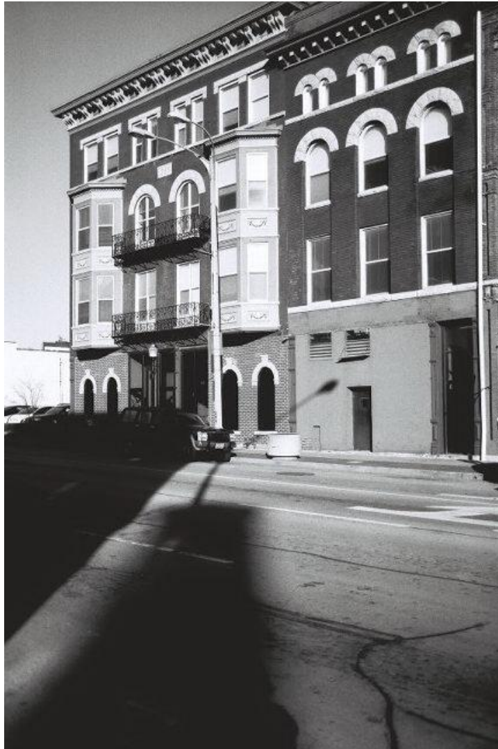
View of primary (west) elevation, looking northeast across Harrison Street. Despite the reconfiguration of the building's storefront, the building retains a high level of historic character.

Address _____ 307 (307-309) Harrison Street _____ City _____ Davenport _____