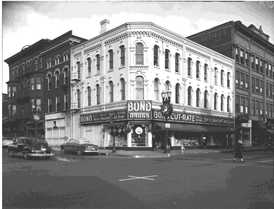
Judging by the automobiles on Harrison Street, this image dates to the late 1930s. The Ficke Block can be seen at the far left.

Address _____ 307 (307-309) Harrison Street _____ City _____ Davenport _____