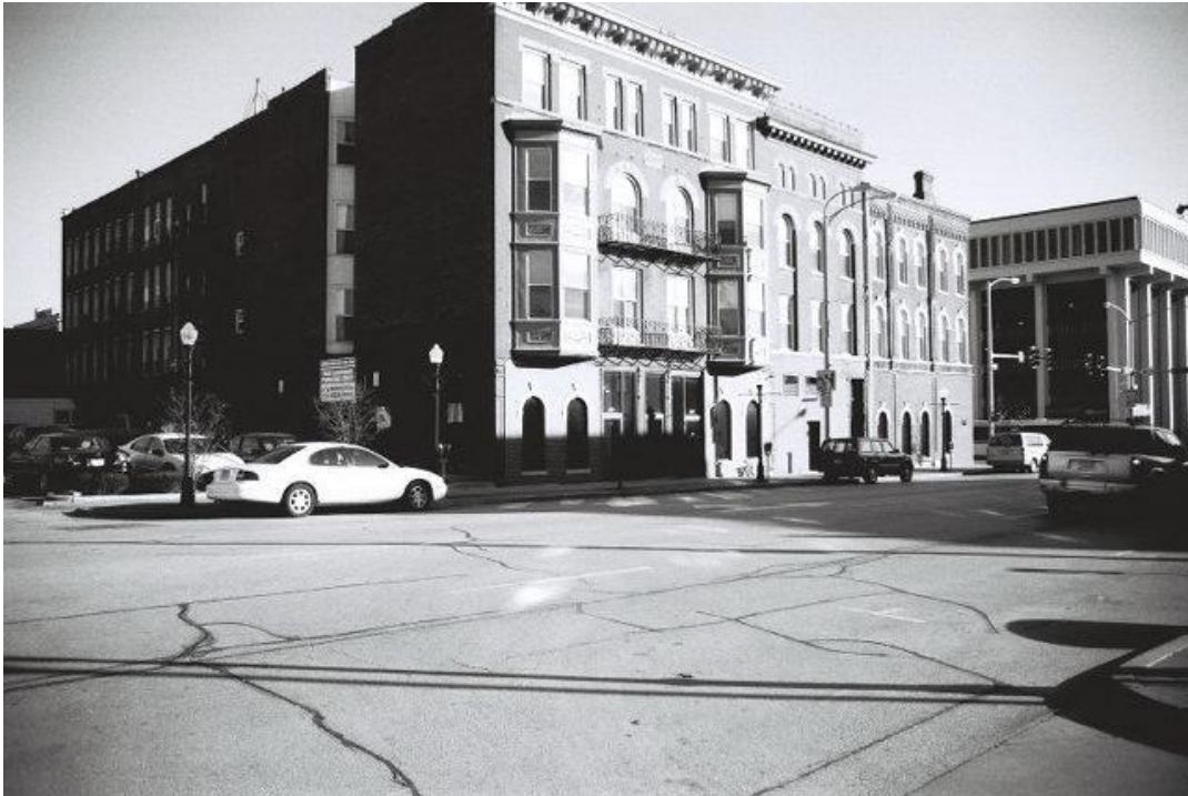
View of the Ficke Block's rear (north) and west elevations, looking southeast across Harrison Street.

Address _____ 307 (307-309) Harrison Street _____ City _____ Davenport _____