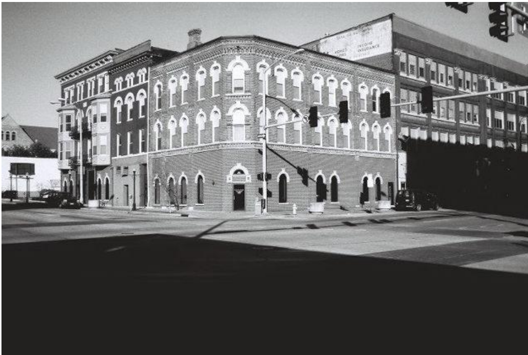
View of the Ficke Block (noted with an arrowhead) within the context of its streetscape.

Address _____ 307 (307-309) Harrison Street _____ City _____ Davenport _____