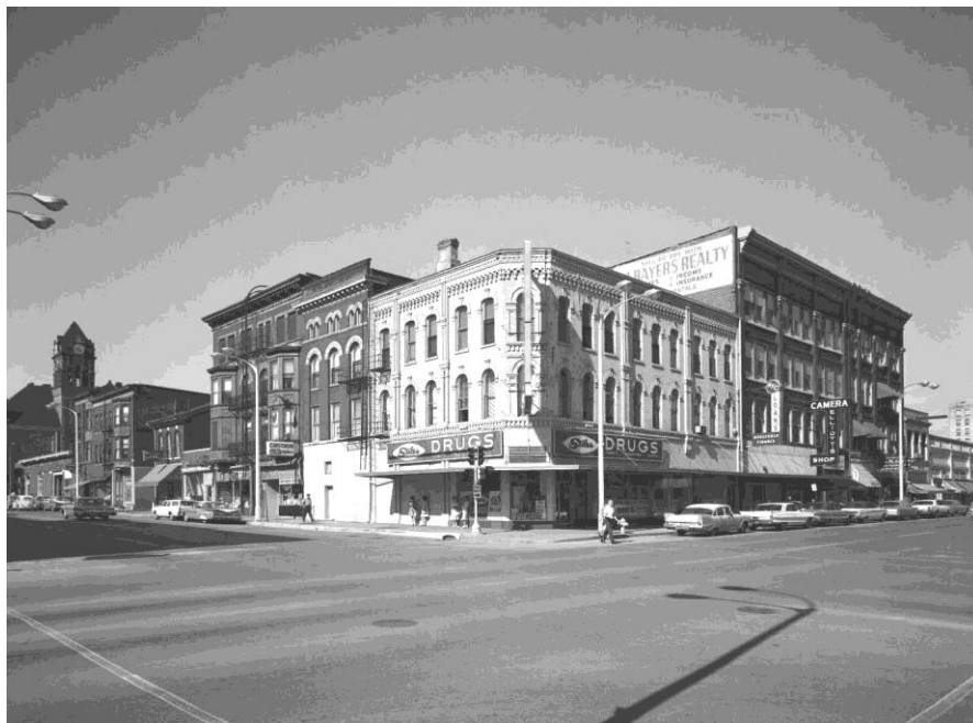
This c.1960 image documents the Ficke Block within the context of its streetscape. It is seen midway down the block on the left. Note the multiple buildings to its north, now non-extant.

Address _____ 307 (307-309) Harrison Street _____ City _____ Davenport _____