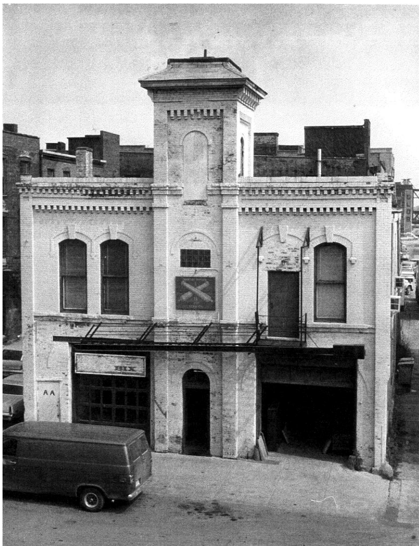
This c.1970 image documents the fire station during a period of decay.