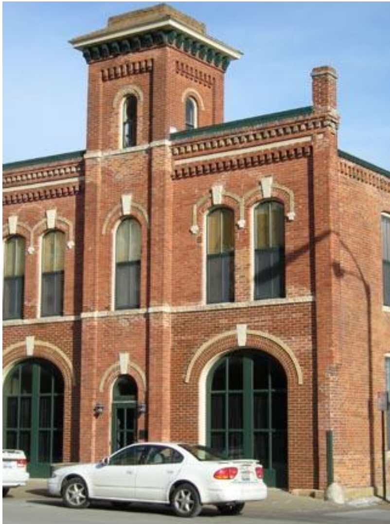
Detail view of the façade. Note the mottled appearance of the brick due to various patching efforts.

Address _____ 117 Perry Street _____ City _____ Davenport _____