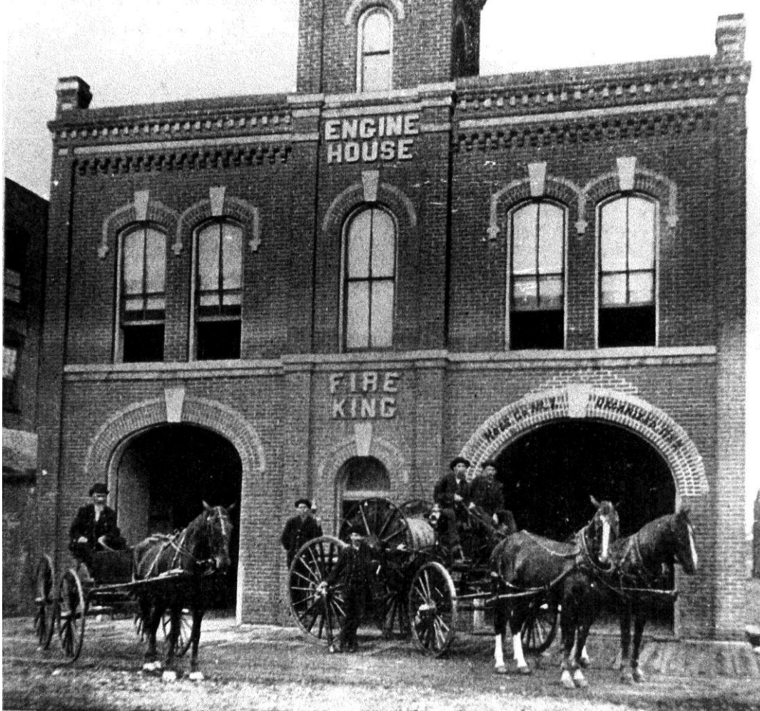
This historic image of the engine house dates to c.1890s. The image confirms the location and appearance of the building's original fenestration.