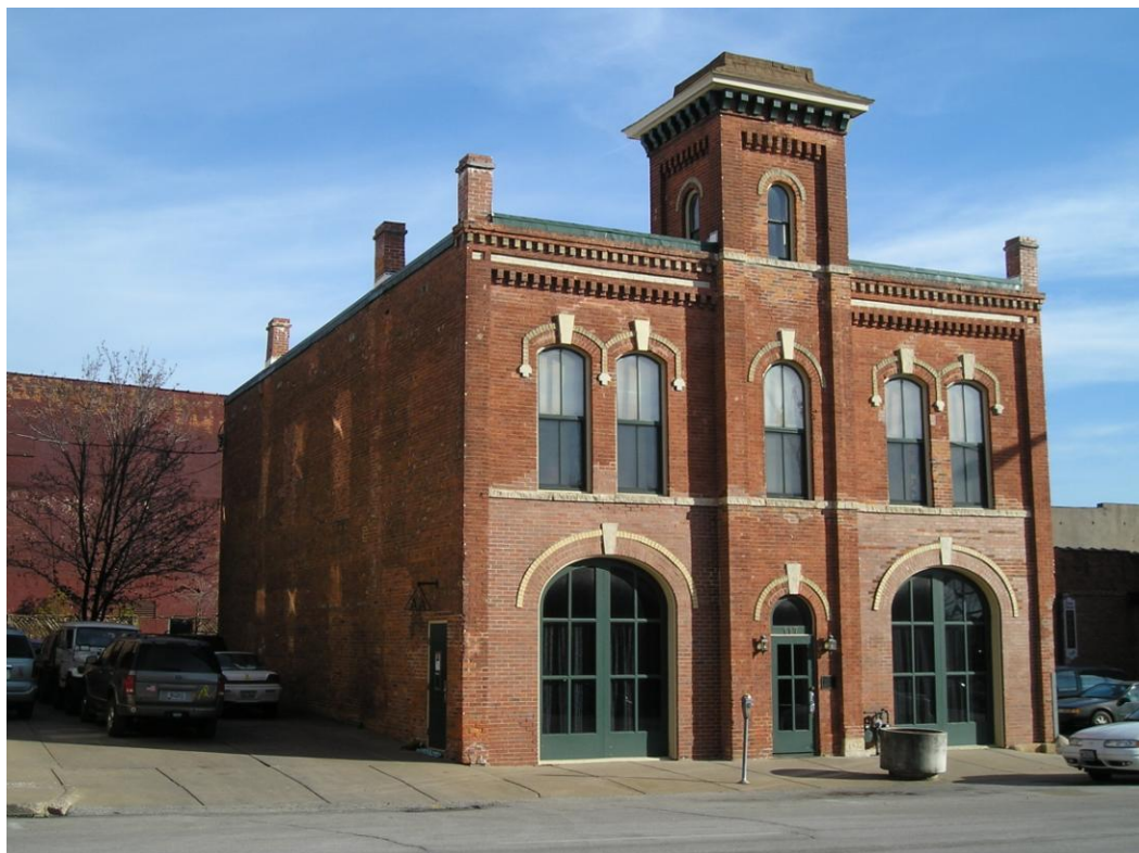
View of the primary (west) and north elevations, looking southeast across Pershing Street.

Address _____ 117 Perry Street _____ City _____ Davenport _____