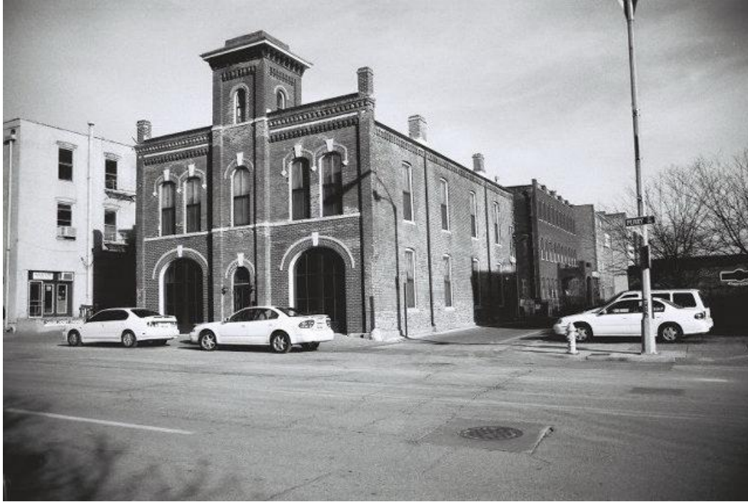
View of the primary (west) and south elevations, looking northeast across Perry Street.

Address _____ 117 Perry Street _____ City _____ Davenport _____